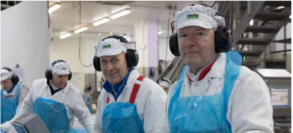
Information in real time to personal terminal. Improved intake monitoring.