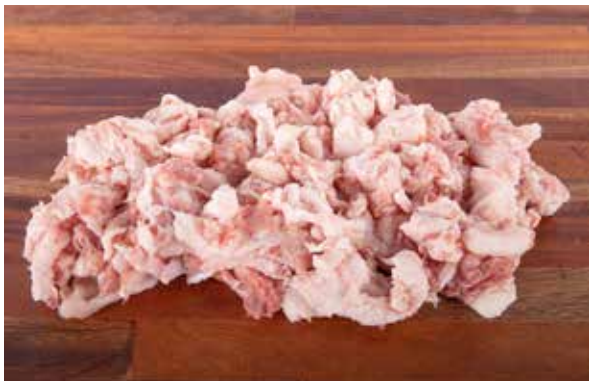
Pork Trimming 50/50 Code: 18067