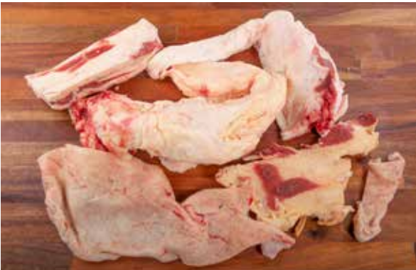
Beef Cutting Fat Code: 18562