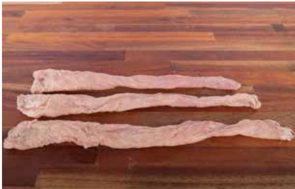
Pork Rectum Code: 18145