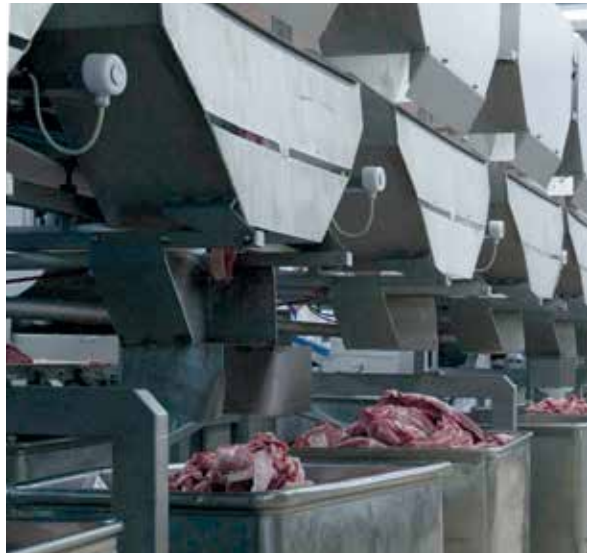
Automatic sorting. Tracking to the farm possible.