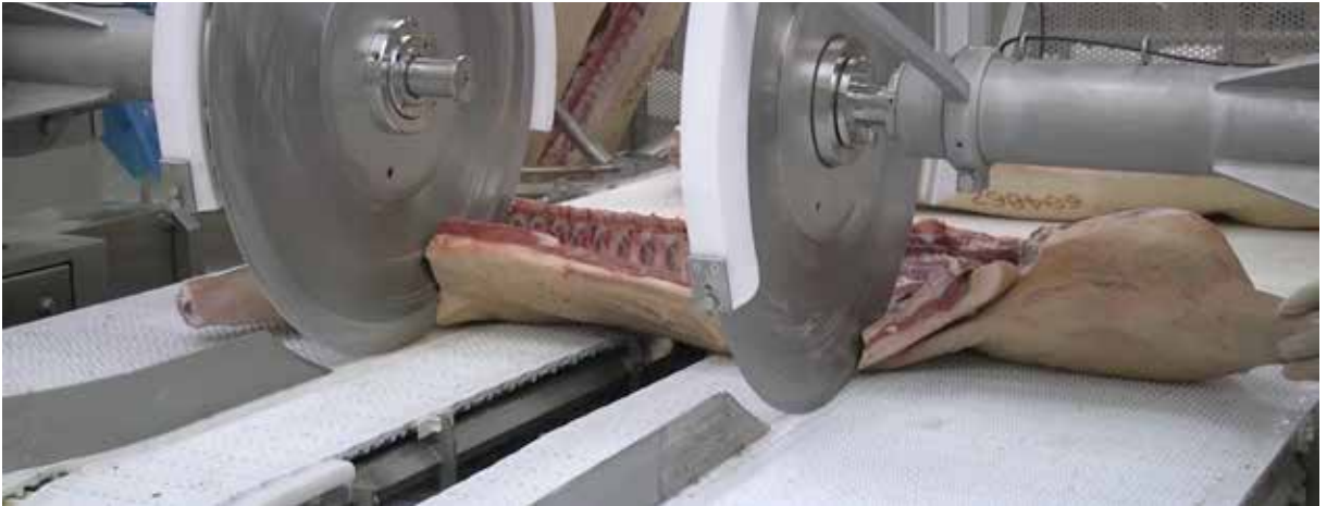
Laserguided primal cutting for pork.