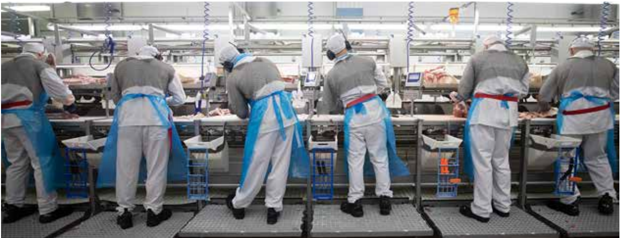
Beef - app. 180 carcasses/day, Pork - app. 1400 carcasses/day