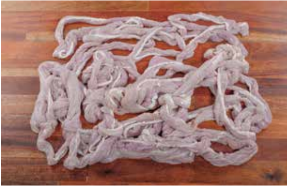
Hog Casing Code: 18198