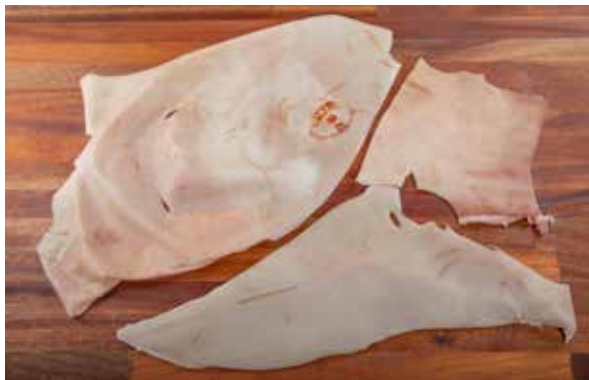
Pork Rind Mixed Code: 18078