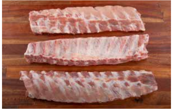
Pork Loin Ribs Big Kamben/Pork Loin Ribs Code: 18088 Code: 18099