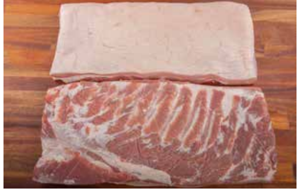
Pork Belly Rindless Code: 18028