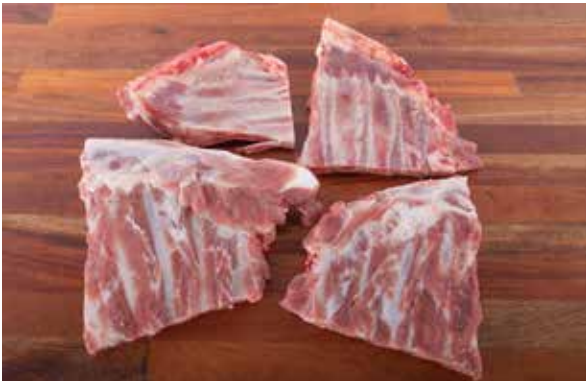
Pork Riblets Code: 18087