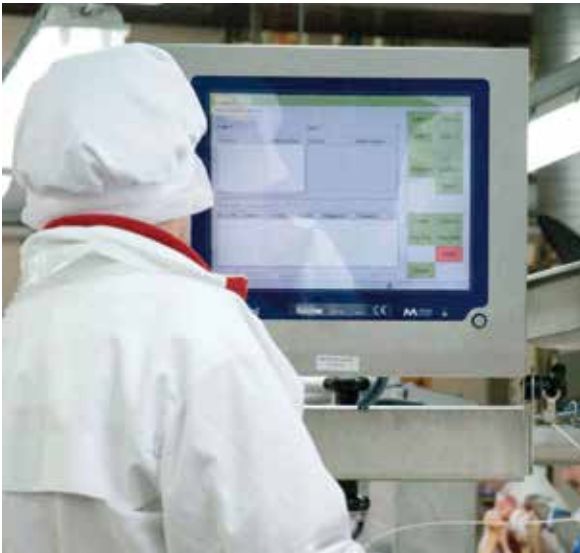
Quality control in real time.