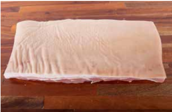
Pork Belly Rind-on Code: 18027