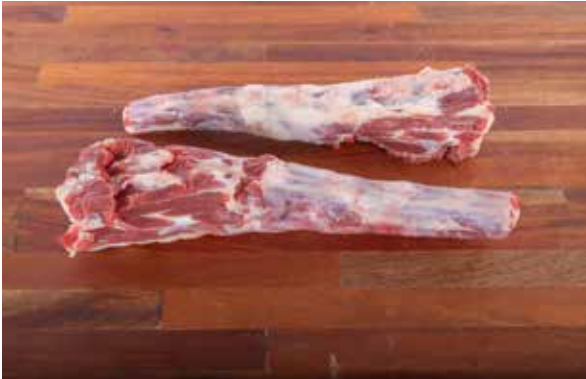
Beef Tail Code: 18620