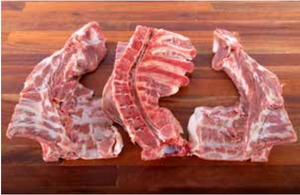
Pork Neck Bone Code: 18086