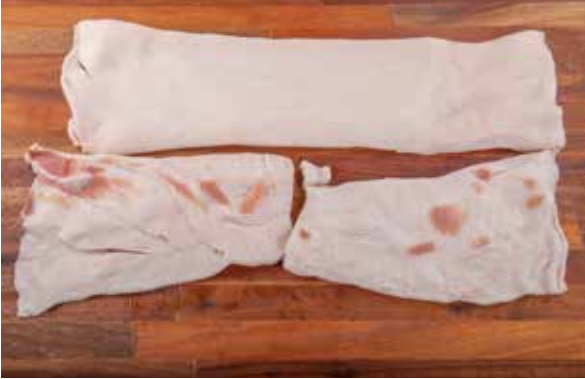
Pork Back Fat Code: 18146