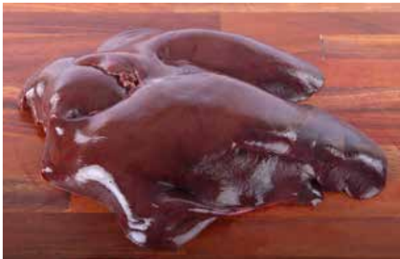
Pork Liver Code: 18193