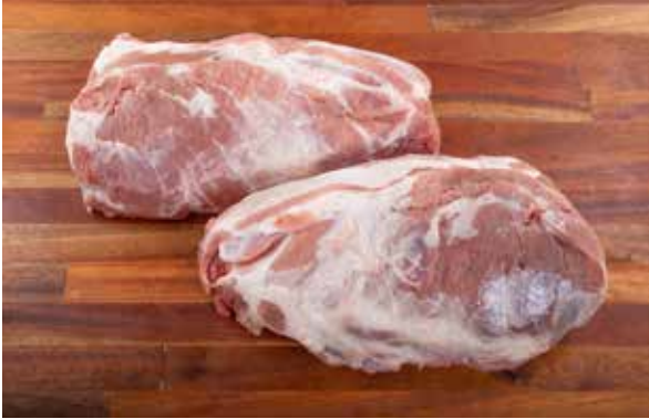
Pork Collar Code: 18010