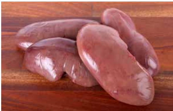
Pork Kidney Code: 18194