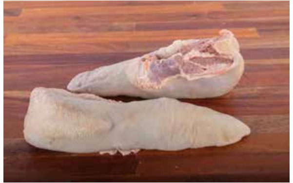
Beef Tongue Code: 18619