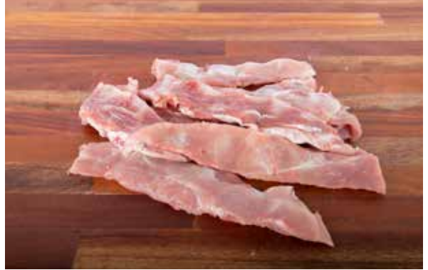
Pork Button Bone Code: 18158